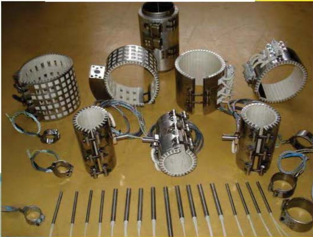
Band and rod heating elements