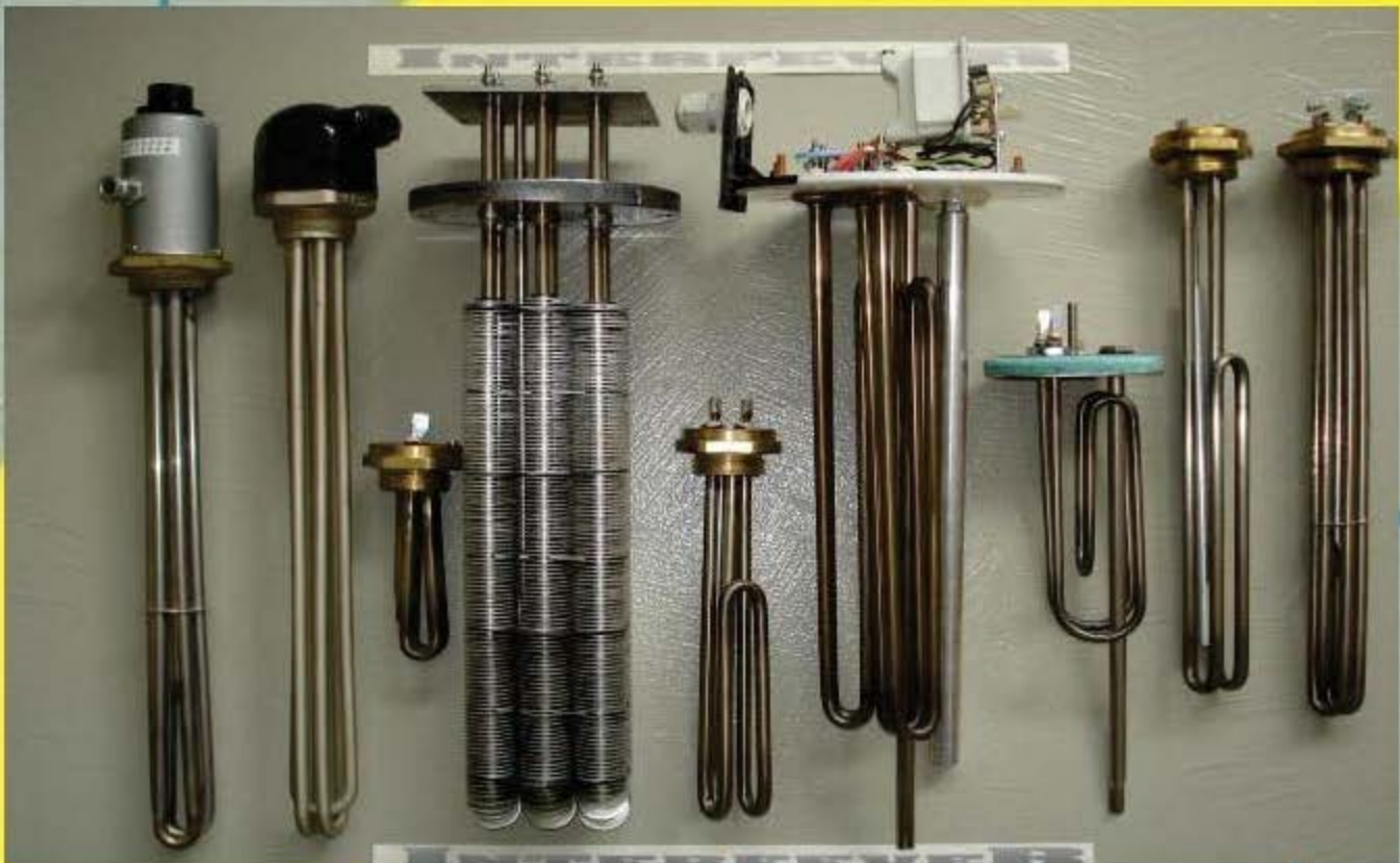
Heaters for boilers