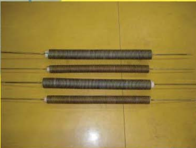
Heaters for Ipsen furnaces