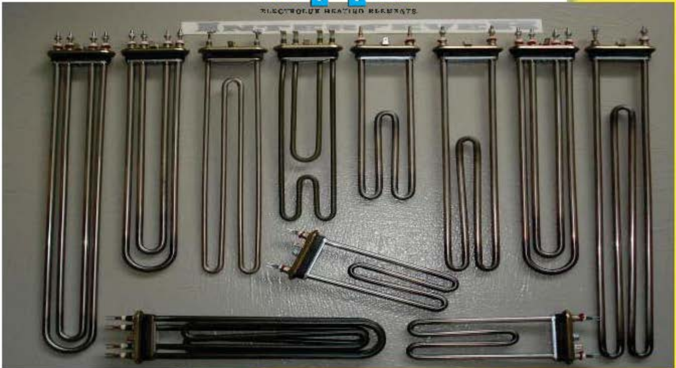
Heaters for drying and washing machines