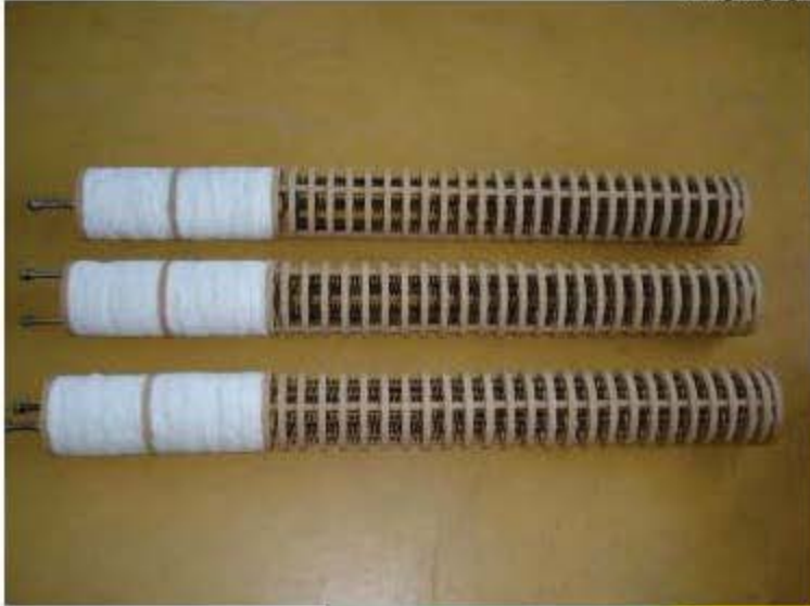
Heaters for Gautchi furnaces