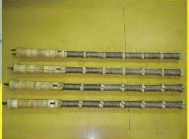
Heaters for Aichelin furnaces