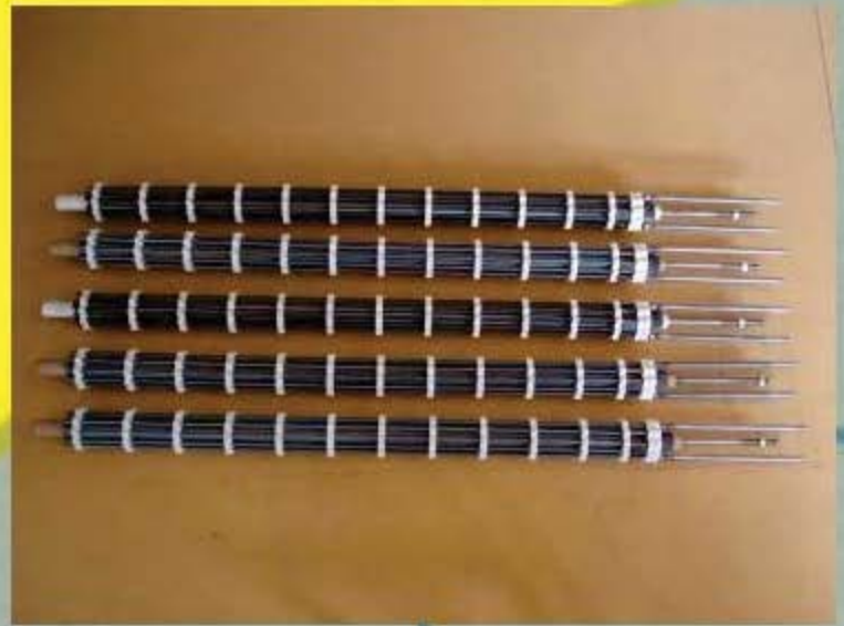
Heaters for muffle furnaces