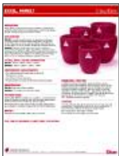
EXCEL HIMELT Roller-Formed SIC