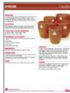
SYNCARB ISO-Pressed Clay Graphite