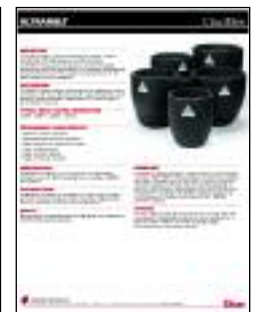
ULTRAMELT ISO-Pressed SIC