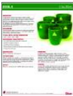
EXCEL E Roller-Formed SIC