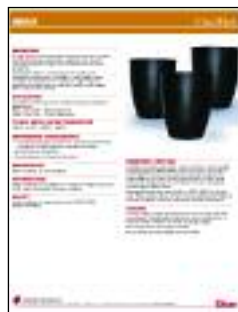
INDUX Clay Graphite