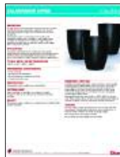
SALAMANDER SUPER Clay Graphite